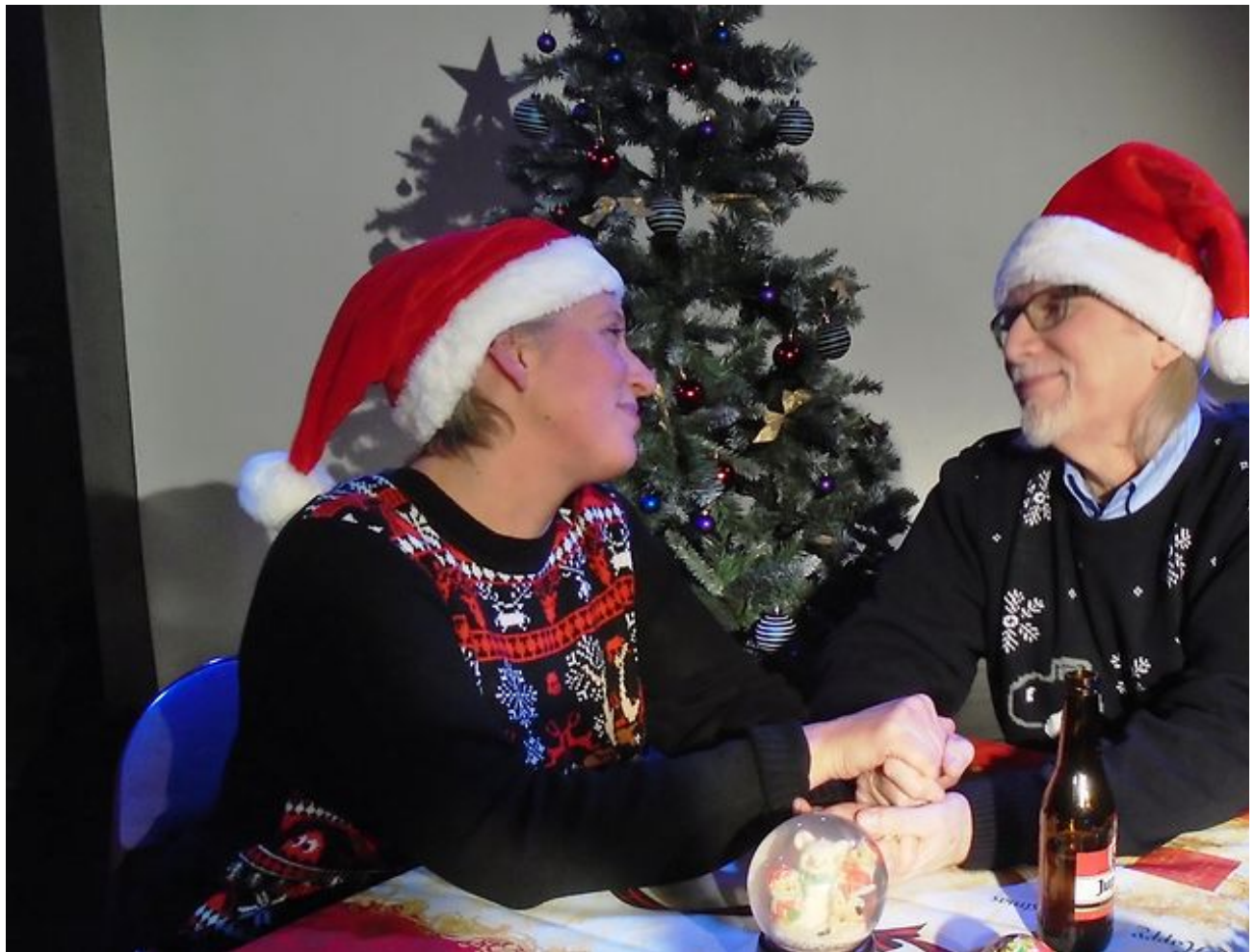
Can writing a letter to Santa help your marriage? Photo: Sarita Rao (#)

Published on Saturday, 2 December, 2017 at 10:33